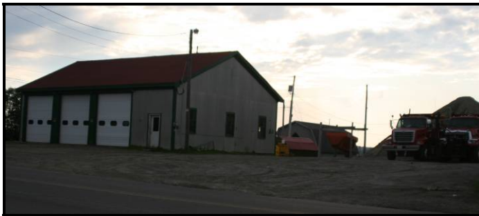
Lubec's Public Works Building is aging and does not have enough room for storage. A replacement structure may also include a salt & sand shed.

The town has identified a site for construction of a replacement salt-and-sand shed and public works garage on Route 189. The new site is on town-owned land, but no funds have been